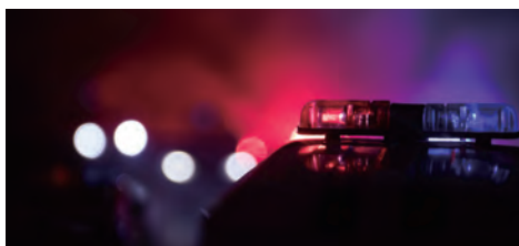
公共安全 / Public safety