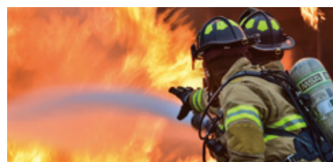
辅助消防 / Emergency fire