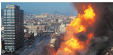
高层消防 / High-rise fire