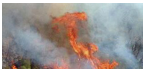
森林消防 / Forest fire