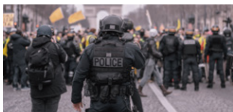
反恐制暴 / Anti-terrorism